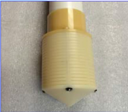
P/N: 703006 Single Point SCH40 Plastic Distributor 2-3/8" diameter and 2" long with 0.012" slots